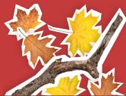
Yard Waste Leaves, Clippings, Debris