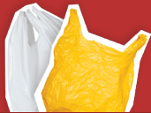
Plastic Bags Return to store