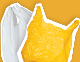
Plastic Bags Return to store