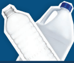
Plastic Bottles & Jugs Empty & Rinsed