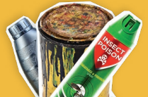
Household Hazardous Waste