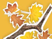
Yard Waste Leaves, Clippings, Debris