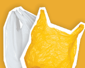
Plastic Bags Return to store