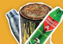
Household Hazardous Waste