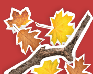
Yard Waste Leaves, Clippings, Debris