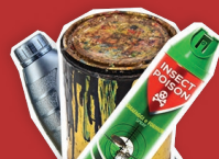
Household Hazardous Waste