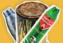
Household Hazardous Waste