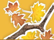
Yard Waste Leaves, Clippings, Debris