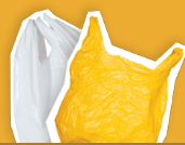
Plastic Bags Return to store