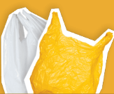
Plastic Bags Return to store