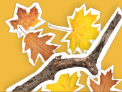
Yard Waste Leaves, Clippings, Debris