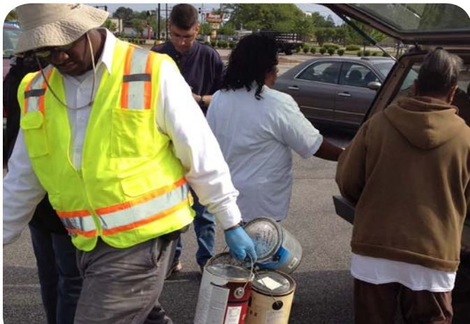
HAZARDOUS WASTE EVENT portsmouth, va

Community volunteers helped collect household hazardous waste.