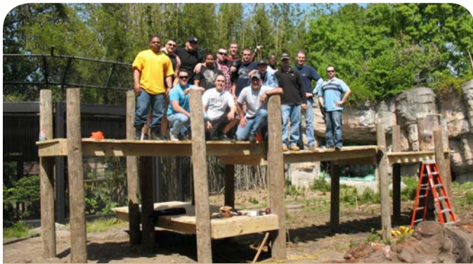
ZOO BEARS norfolk, va

Twenty different civic groups from across the City of Norfolk helped to pick up litter at 20 different sites.