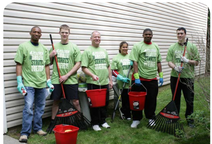
HOPE HOUSE FOUNDATION virginia beach, va

Volunteers from the US Navy Helicopter Sea Combat Squadron Nine helped with general cleanup and landscaping around the Hope House Foundation building.