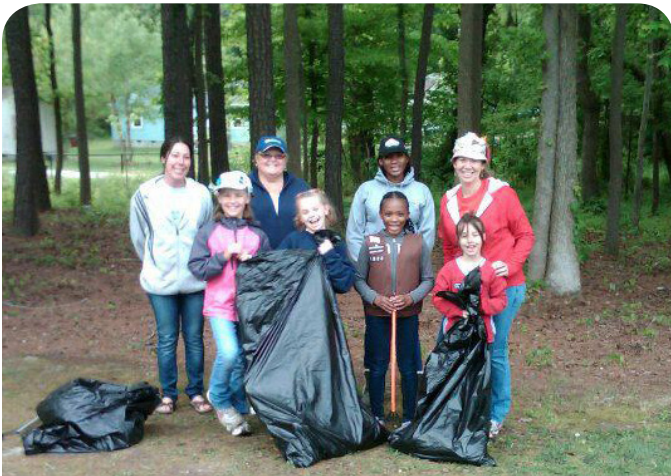
CHARLES BROWN PARK york county, va

101 volunteers 1,300 pounds of litter/debris 5 cubic yards of invasive species/weeds removed