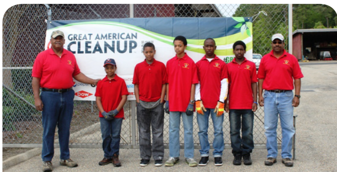
STORM DRAIN MEDALLIONS williamsburg, va